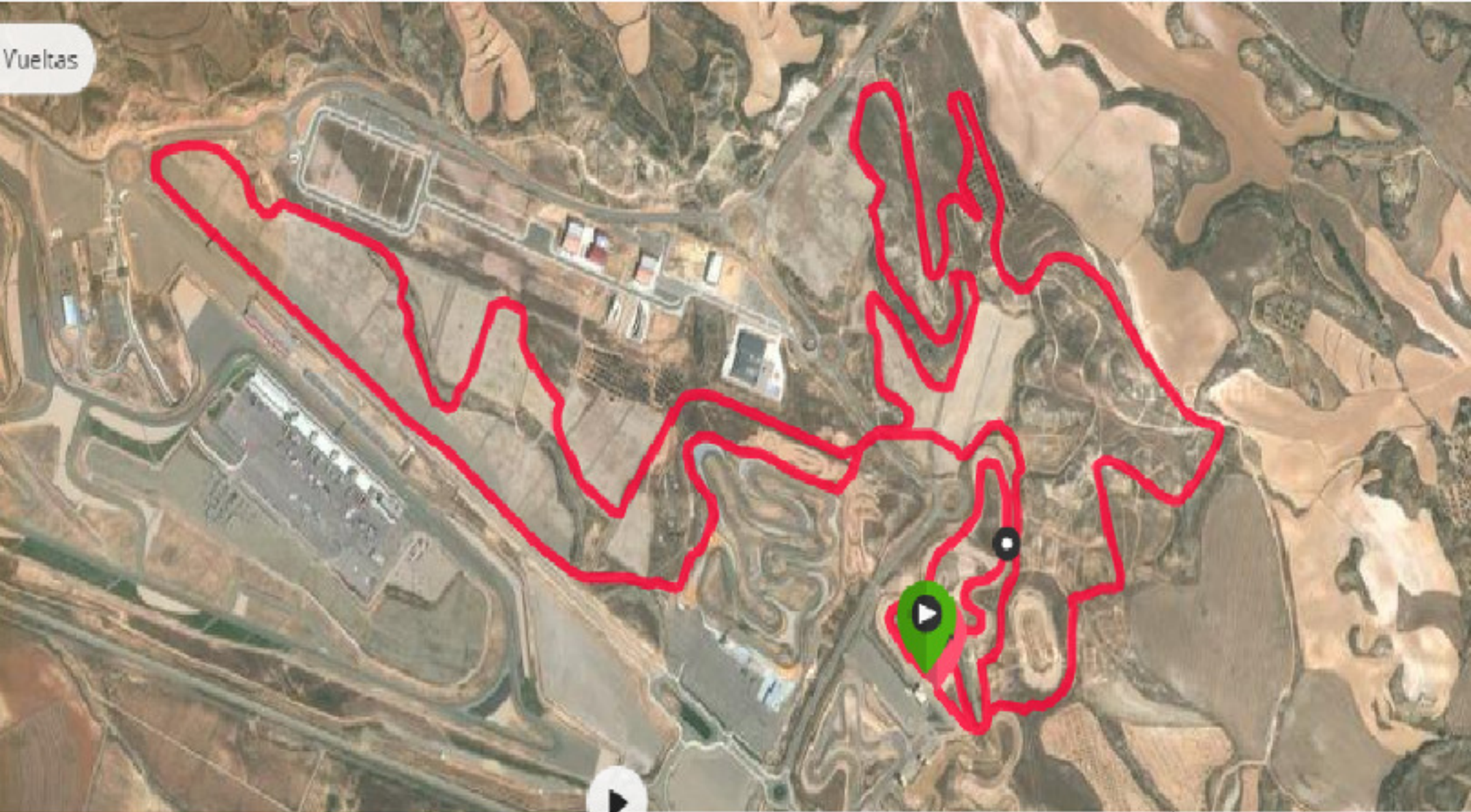
CIRCUITO BTT (10 KMS.)